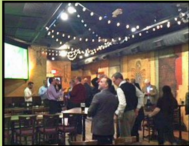
Jack Johnson's event in Ann Arbor

Maybe you can Hoop-It-Up with us by doing a deal with us and secure an invitation to one of our next MCDC events.