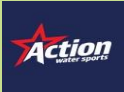
Action Water Sports