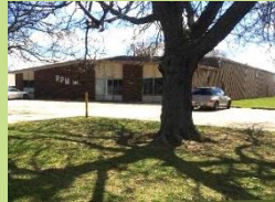
Fidler Furniture Company