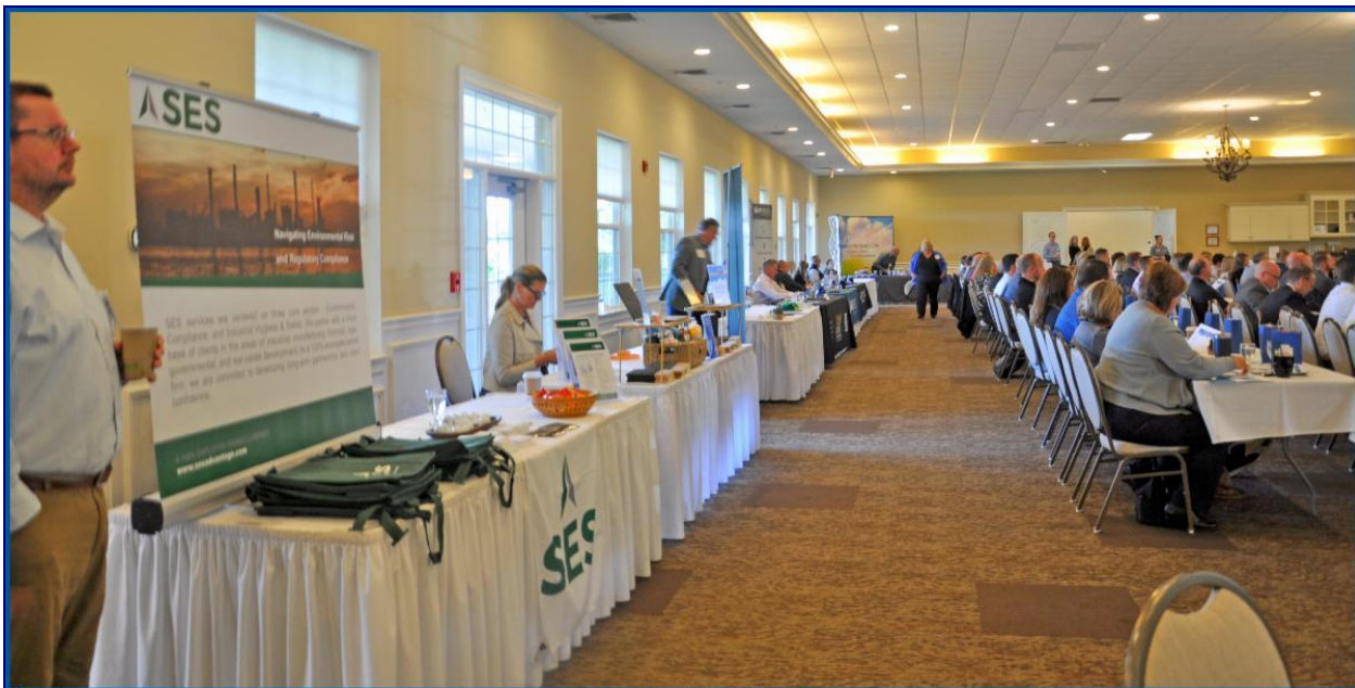
2023 MCDC SBA Lender Conference Vendors